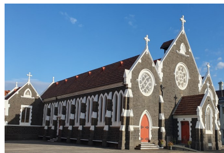
We acknowledge the Wurundjeri people, the traditional owners and custodians of the land on which we stand.